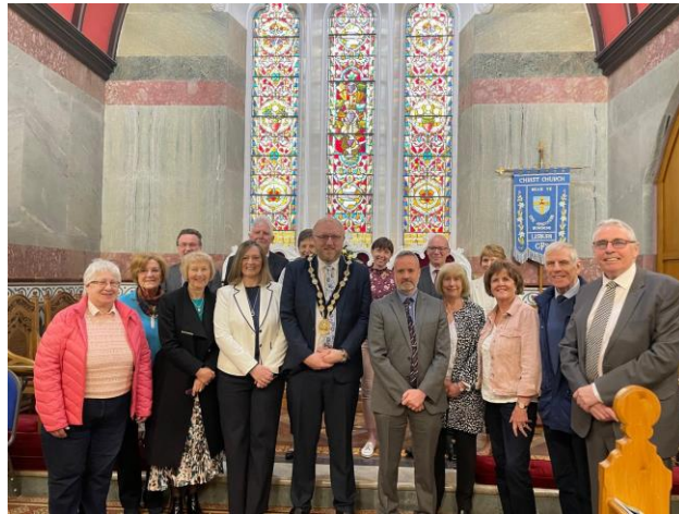
1 - The Mayor of Lisburn and Castlereagh council with the principals, members of the board of governors and some previous staff of Lisburn Central Primary School and Old Warren Primary school.