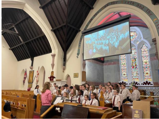
3 - The choir from Central and Old Warren.