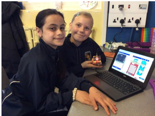
P.7 Young Enterprise Business teams working on their projects