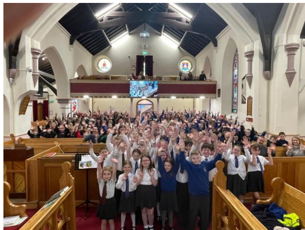
2 - Some of the pupils of Lisburn Central and Old Warren Primary schools.